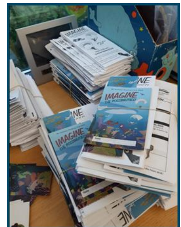
Summer Reading Club packages ready for registration day