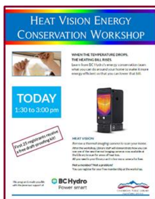
Heat Vision project launch poster

5 thermal imaging cameras 12 loans after program launch 1 Energy conservation workshop