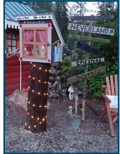
98 Little Libraries Released into Cranbrook in 2019

Approved: 19 February 2020 Cranbrook Public Library Board Regular Meeting